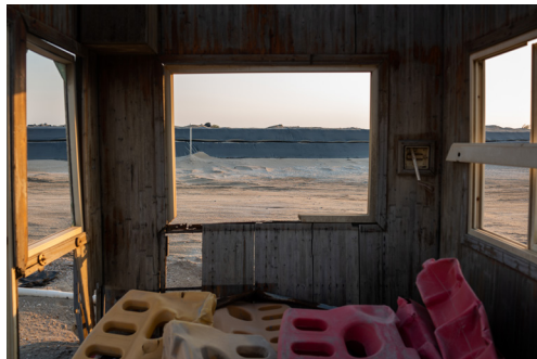
沈绮颖, 选自《流沙志》系列, 2017年。Sim Chi Yin, From Shifting Sands series, 2017.

沈绮颖:《流沙志》&《保持沉默的大多数》 Sim Chi Yin: Shifting Sands & Most People Were Silent