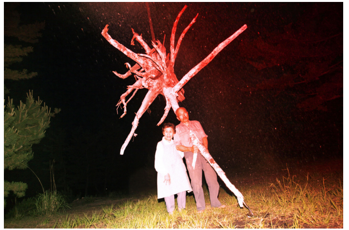
志贺理江子,《耕种者肖像》,2009年。 Lieko Shiga, Portrait of Cultivation , 2009.