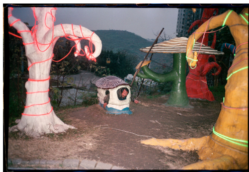
华伟成, 选自《到洋人街去》系列, 2019年。图片由艺术家提供。 Hua Weicheng, From Go To The Alien Street series, 2019. Courtesy of the artist.

华伟成:《到洋人街去》 Hua Weicheng: Go To The Alien Street