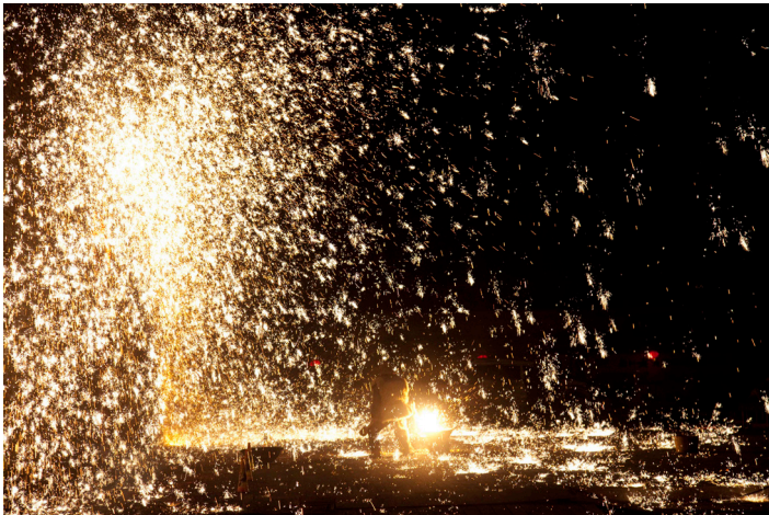
川内伦子,《无题》选自《光晕》系列,2016年。 Rinko Kawauchi, Untitled from the series of Halo , 2016.