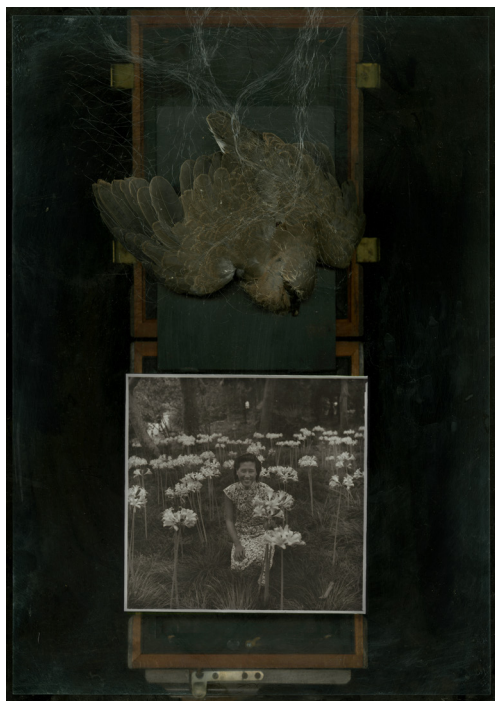
马良, 选自《彼岸花》系列, 2020年。 Maleonn, From Faramite Flower-poetry for Unknown from Old Photos series, 2020.

马良:《诗, 镜子与招魂术》 Maleonn: Sonnet, Mirror and Necromancy