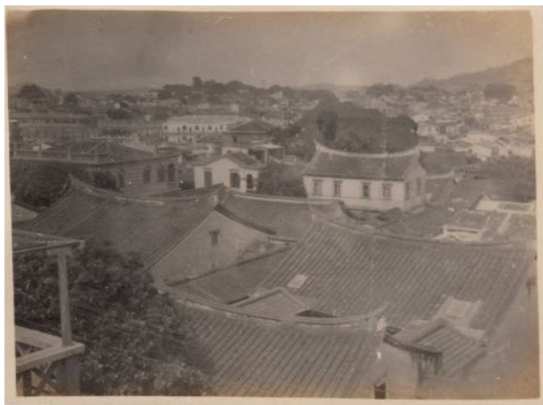
刘抗,《厦门鸟瞰图之二》,1928年。 Liu Kang, The Bird's Eye View of Xiamen No. 2 , 1928.

2场“在地行动”单元展览: 旨在探索摄影与摄影季举办地之间的联系。《回家——刘抗相册里1928年前后的福建影像》(策展人:王欣)将展出祖籍福建的新加坡艺术先驱刘抗在故乡福建拍摄的珍贵摄影作品,本展览是时隔90年的第一次返乡呈现;《一场关于故乡的认知试验——山、水、与城》(策展人:周小登)呈现了6位优秀的青年艺术家关于“闽城”与“闽山”,以及“水”与“故乡”的主题作品。艺术家分别是:梁廷玮、廖泽鲲、刘旭阳、曾泽鲲、张钰、周子杰,工作坊导师:陈亚婷。