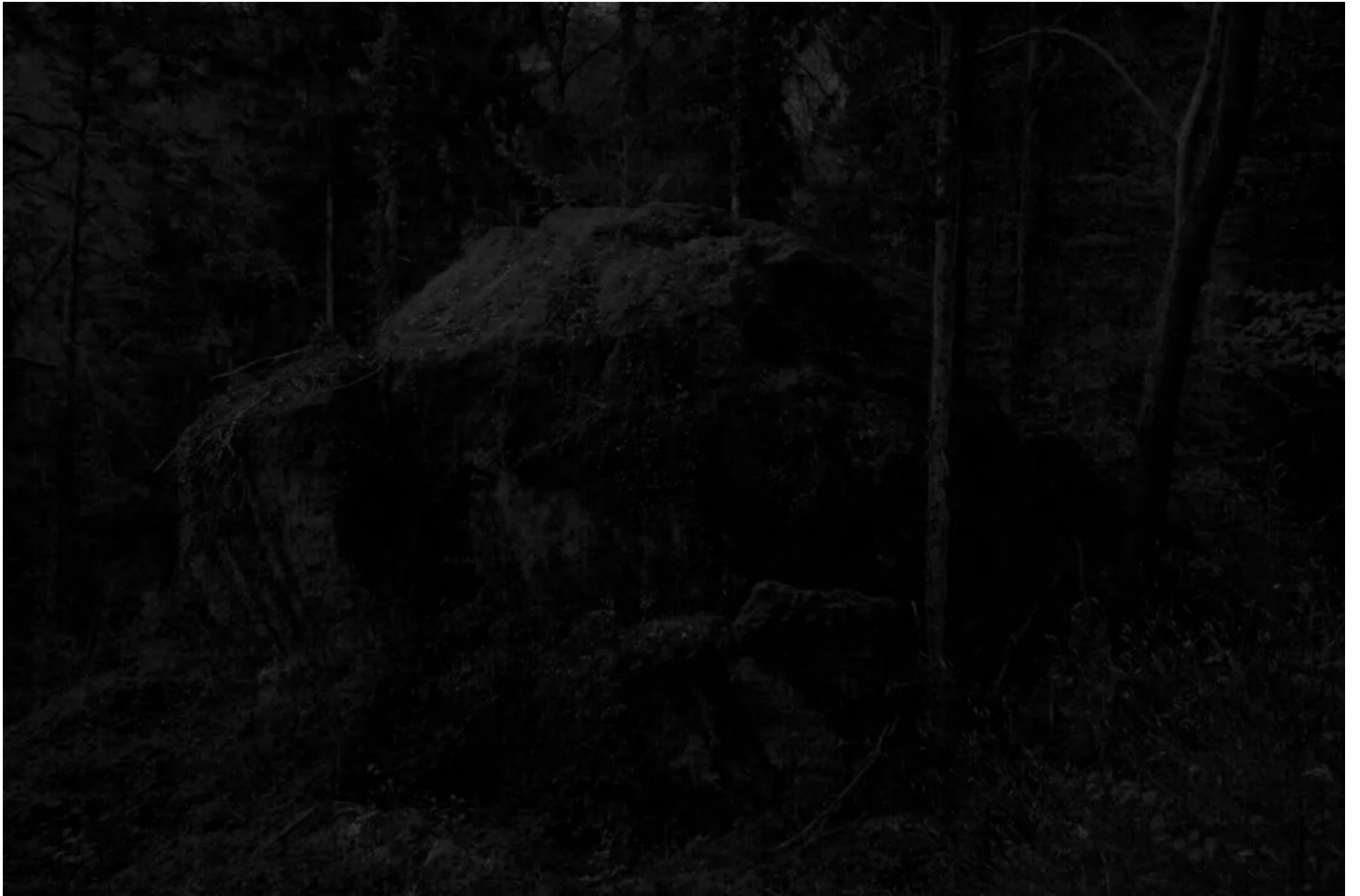
Blocs of Monster 2, 2018