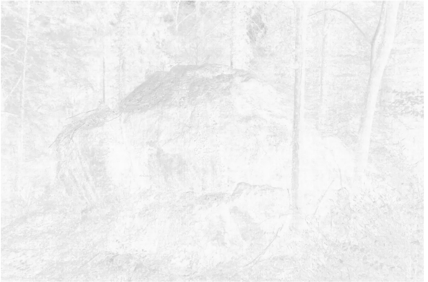
Blocs of Monster 2 negative, 2018