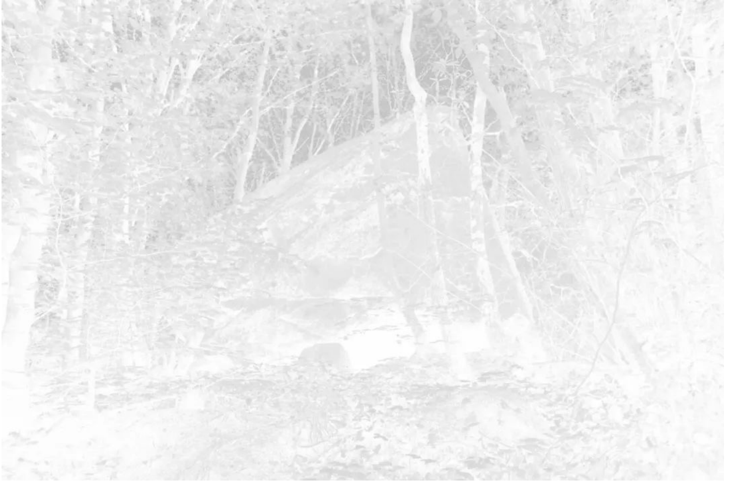
Le bloc stude negative, 2018