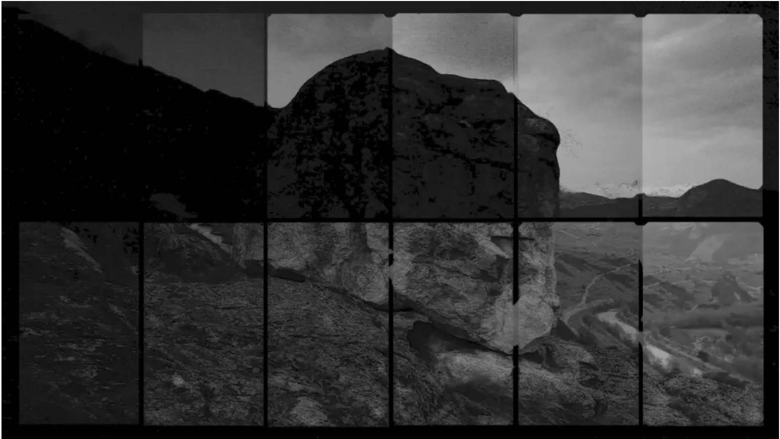
Le Bloc Venetz, 2018