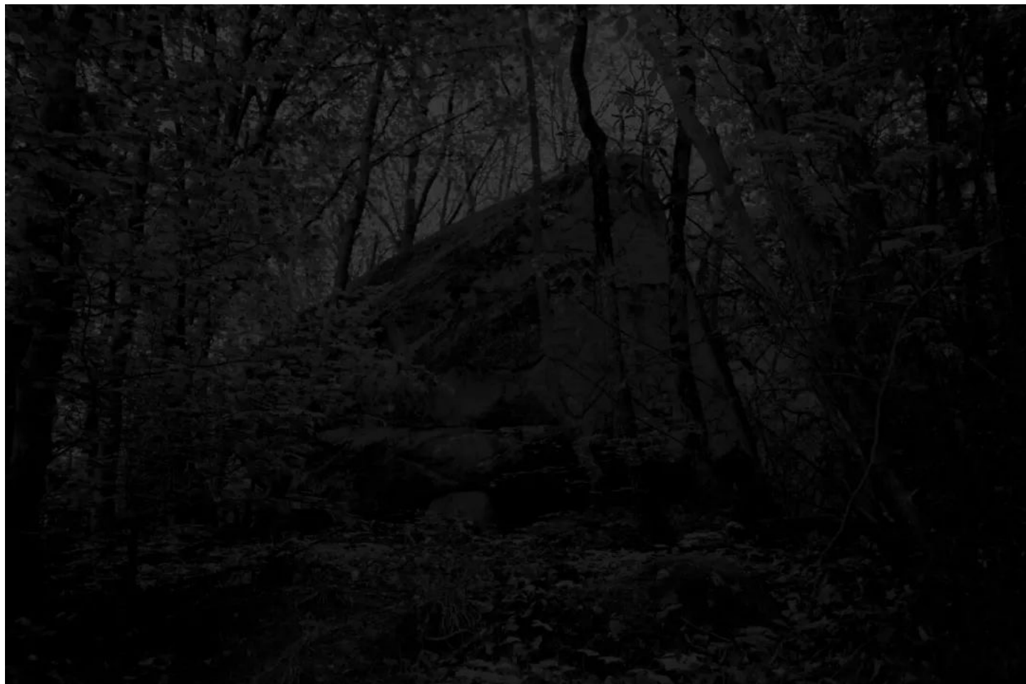
Le bloc studer, 2018