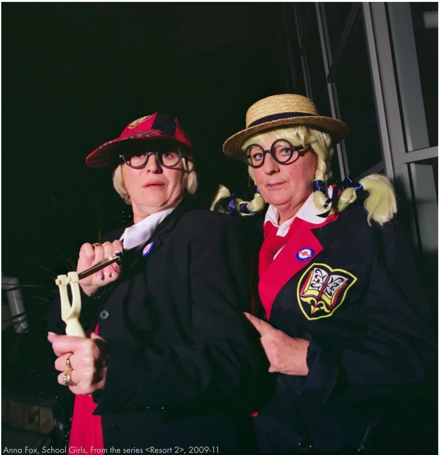
Anna Fox, School Girls, From the series <Resort 2>, 2009-11