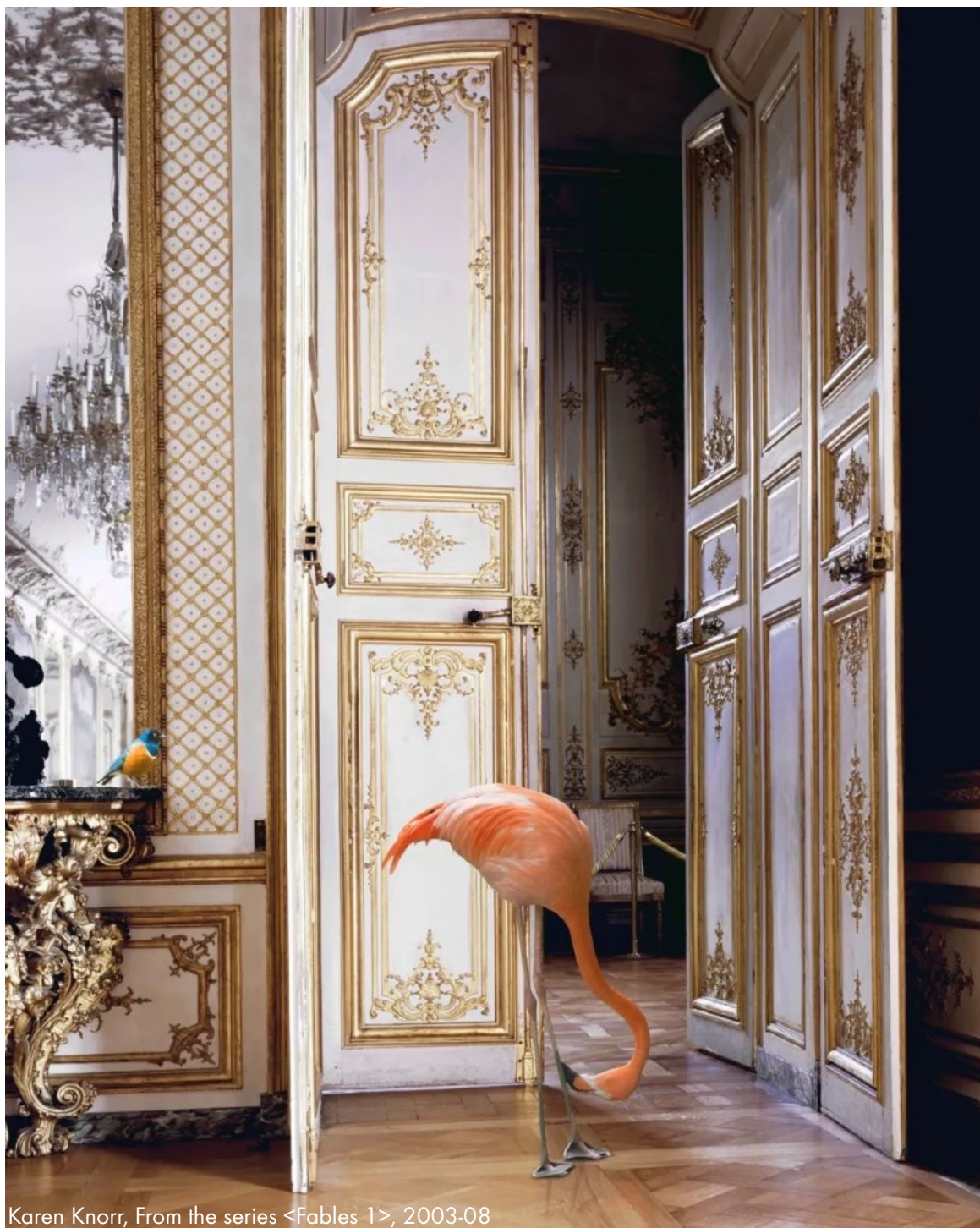
Karen Knorr, From the series <Fables 1>, 2003-08